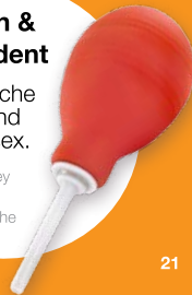
Lovehoney BASICS Anal Douche

Use a douche for safe and clean anal sex.