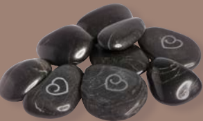
Lovehoney Massage Rocks

Send your partner into a state of blissful relaxation with a sensual massage.