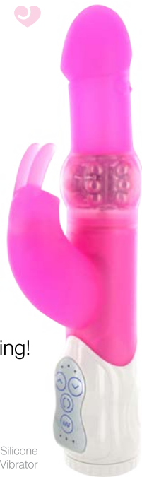
Lovehoney Realistic Silicone Oh! Rabbit Vibrator

With vibrating rabbit ears and an action-packed shaft, the rabbit vibrator has been responsible for millions of orgasms worldwide – and we're not complaining!