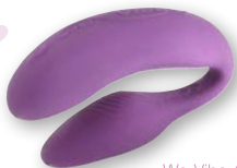
We-Vibe 4 Remote Control Couples Vibrator

Sex toys designed to be worn during intercourse can help you achieve the ultimate sexual goal – climaxing at the same time. Expertly engineered for mutual stimulation, the We-Vibe is perfect for shared pleasure.