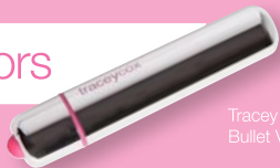
Tracey Cox Supersex Bullet Vibrator

On your own or with a partner, a vibrator can make it easier to reach orgasm. Bullet vibrators are great for clitoral stimulation – use during sex for a discreet pleasure boost!