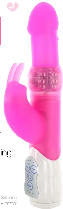
Lovehoney Realistic Silicone Oh! Rabbit Vibrator

With vibrating rabbit ears and an action-packed shaft, the rabbit vibrator has been responsible for millions of orgasms worldwide – and we're not complaining!